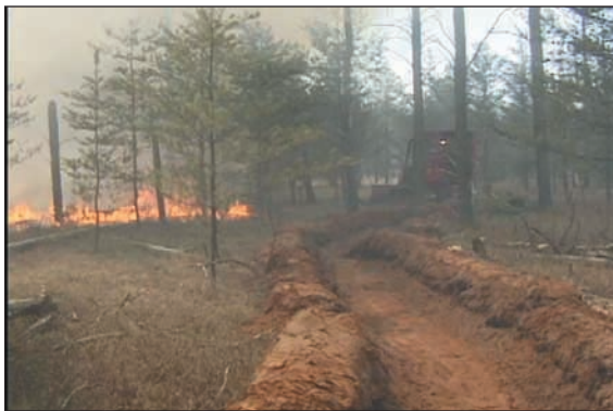
Figure 3. Creating a fuelbreak.

Large wildfires can move rapidly across the landscape, though not like a tidal wave, as is often depicted in the media. A wildfire moves from point to point across the ground as its requirements for heat and fuel are met. If an area contains no fuel, the fire will not go there. This is why wildland firefighters typically control wildfires by removing all vegetation (fuel) down to mineral soil to create a fuelbreak (Figure 3).