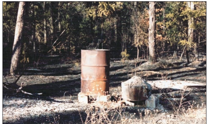
Figure 2. One-third of Michigan wildfires are caused by debris burning.

Wildfires can start in many ways, but about 98 percent of fires are caused by human activities. One-third of all wildfires are caused by people burning debris (household and yard waste, Figure 2). A moment's inattention or an unexpected change in the weather can rapidly turn a debris fire into a wildfire. Once a wildfire starts, it may be impossible for a homeowner to put out.