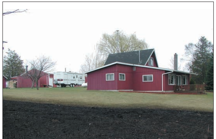
Figure 4. Wildfires cannot burn where there is no fuel.

The amount of radiant heat a wildfire can transfer to your home depends on how far the fire is from the structure and how long it stays there. Research has shown that it is impossible for the radiant heat from a wildland fire to ignite a typical wood-sided home from more than 100 feet away. In fact, in simulations with actual fires and in case studies, homes as close as 33 feet from a wildfire have survived if the flames cannot actually touch the structure (Figure 4).