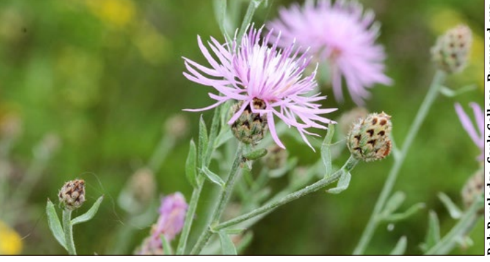
Spotted knapweed ( Centaurea stoebe ) releases a chemical through its roots that is toxic to other plants, allowing it to be a widespread invasive problem in Michigan.

Published February 2018. This material is based upon work supported by the USDA and the National Institute of Food and Agriculture award number(s) 2017-70006-27175.