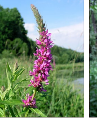
The invasive wetland plant purple loosestrife (Lythrum salicaria) produces many seeds dinalis) has very small seeds, and its stems and roots break off easily to form new plants.