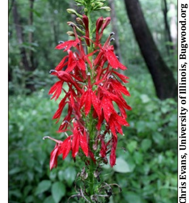
In contrast, the non-invasive cardinal flower (Lobelia cartender seedlings and a short life.