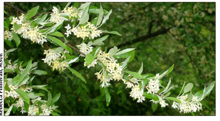
Invasive autumn olive (Elaeagnus umbellata Thunb.) in flower.