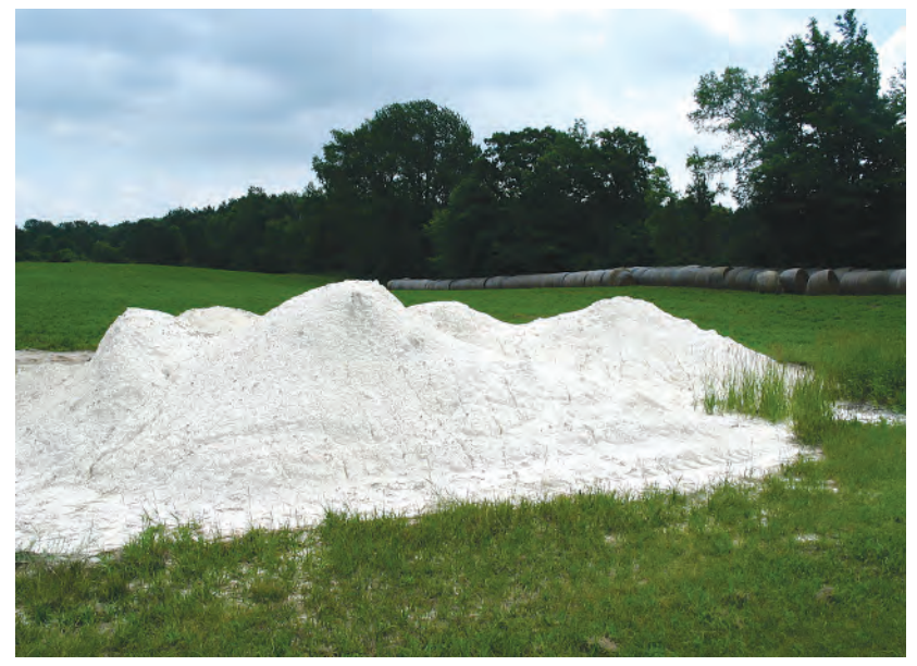
A delivery of lime is ready for application.

For marl and refuse limes, the volume (cubic yards) and test value expressed as pounds of calcium carbon equivalent per cubic yard are to be stated in place of the neutralizing value and screen size information.