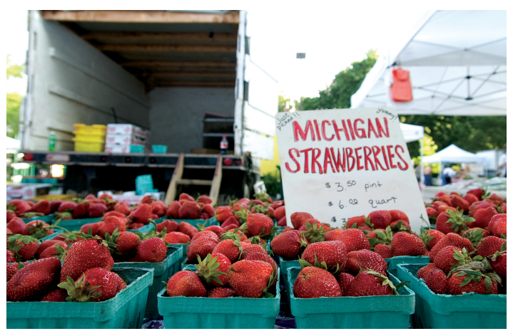
Figure 3: Fresh Michigan strawberries available at a farmers' market in Illinois.

The miles that food travels are just one aspect of local food systems. For example, asparagus labeled "Michigangrown" does not tell us anything about how that asparagus was grown. Even though the asparagus was grown locally, its GHG emissions depend in part on other practices such as whether pesticides and fertilizers were applied efficiently and sustainably. Knowing your farmer and asking meaningful questions is a great way to obtain information on how your food was raised and transported. When consumers and producers interact directly, there is opportunity for open dialogue on sustainability practices<sup>17</sup>. Does your farmer use synthetic fertilizers? Does he or she try to reduce fuel usage on the farm? Does he or she do on-farm composting and apply the compost onto farm fields? Strike up a conversation with your farmer, and you might be surprised how much you can learn.