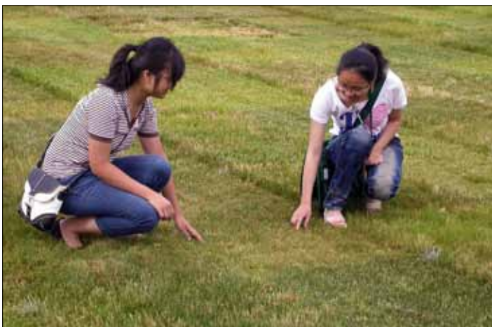
Lawns mowed at 3.5 or 4 inches out-compete weeds, tolerate grubs and look just as good as lawns mowed at 2.5 inches.

The highest setting on your mower! The top setting for most mowers gives a cutting height between 3.25 and 4 inches. This is best for your lawn, but at a setting of 4 inches you may sometimes see some "laying-over" of turf blades that some people find undesirable. For this