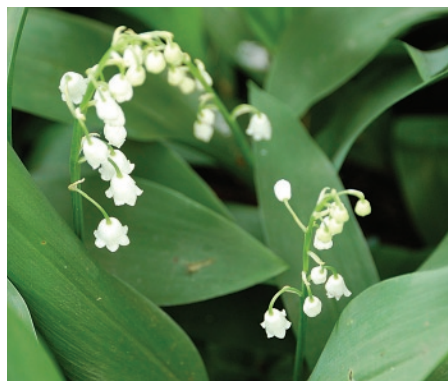
Lily of the valley

Hydrangea — A woody shrub 3 to 5 feet in height with white, pink or blue flowers in dense heads and long, broad, oval leaves. Cyanide poisoning may occur if horses are allowed free access to hydrangeas or their prunings. Colic-like symptoms and bloody diarrhea may result upon consumption, along with labored breathing, weakness, coma and death if toxic levels of cyanide are absorbed from the intestinal tract.