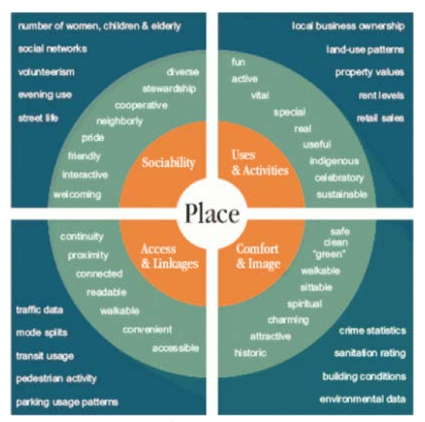
Figure 2: Components of placemaking | Graphic by Glenn Pape of MSU Land Use Institute from a similar graphic by Project for Public Places, New York.

The most important thing about "quality place" is that each community has its own unique characteristics. Each community has its own set of assets and attributes that are genuine for that community. One should build on those unique assets to enhance and build place.