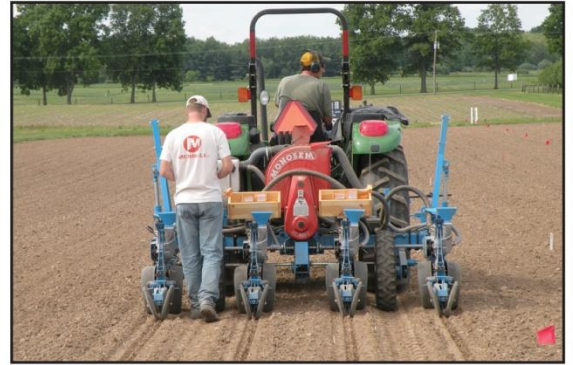
Planting organic soybean trial at KBS, May 2013.

It often benefits growers to select a few good varieties for planting each year. Yield determination and careful field evaluation during the growing season will add to the grower's knowledge of variety performance and allow for better selection.