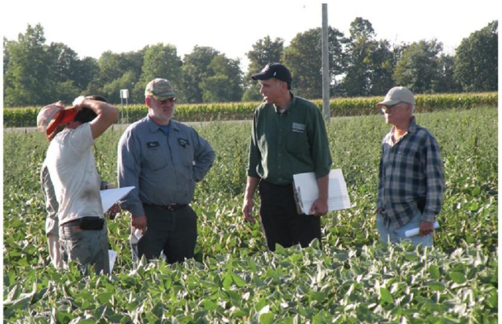
Farmers, breeders and project team review soybean varieties during the Sept. 6, MSU Extension Summer Organic Tour.

Nearest city: Hickory Corners Cooperator: W.K. Kellogg Biological Station Soil type: Kalamazoo sandy loam Previous crop: Fallow Tillage: Spring: chisel plow, field cultivate Planting date: June 4, 2013 Harvest date: November 10, 2013