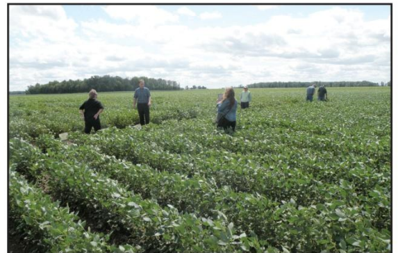
The management team from the North Central Region Sustainable Agriculture Research and Education Program touring the Caro trial August 13, 2013.