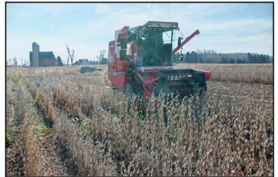
Harvesting soybeans at Columbiaville site, November 2013.