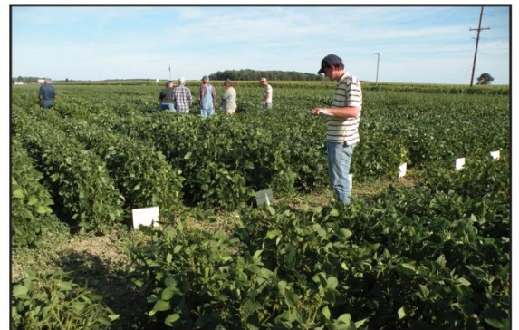
Field day at Middleton organic soybean variety trial, September 2013.