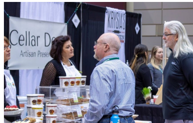
Making it in Michigan convention in Lansing, MI 2023

labeling, packaging, and nutritional analysis. If you are interested in business counseling from the MSU Product Center, please visit the website or Facebook page!