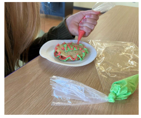
Food Safety event for holiday cookie raw dough consumption and kids.