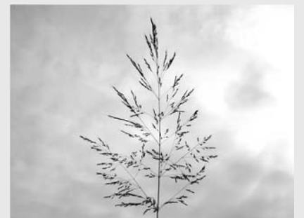
Open-branched, reddish panicle