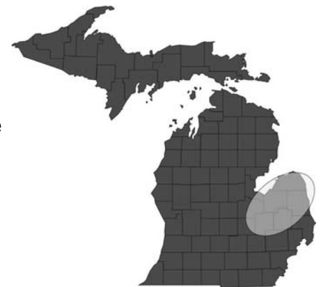
Common distribution of windgrass in Michigan