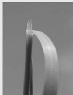
Jagged membranous ligule