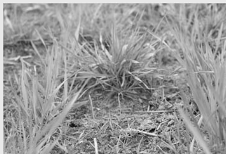
Tillering of windgrass in wheat