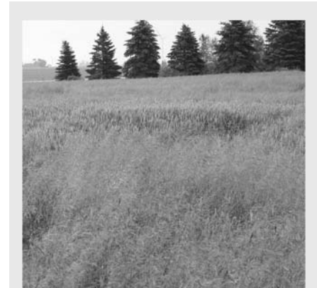
Windgrass in a Michigan wheat field

Common windgrass ( Apera spica-venti L.) is a winter annual grass species that has become more of a weed problem in winter wheat production. In the past the distribution of common windgrass in Michigan has been limited. However, over the last several years this weed has been reported in several counties. Management of this weed can be difficult because the emergence pattern and growth closely coincide with winter wheat, and the availability of selective herbicides is limited.