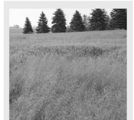
Windgrass in a Michigan wheat field

Common windgrass ( Apera spica-venti L.) is a winter annual grass species that has become more of a weed problem in winter wheat production. In the past the distribution of common windgrass in Michigan has been limited. However, over the last several years this weed has been reported in several counties. Management of this weed can be difficult because the emergence pattern and growth closely coincide with winter wheat, and the availability of selective herbicides is limited.