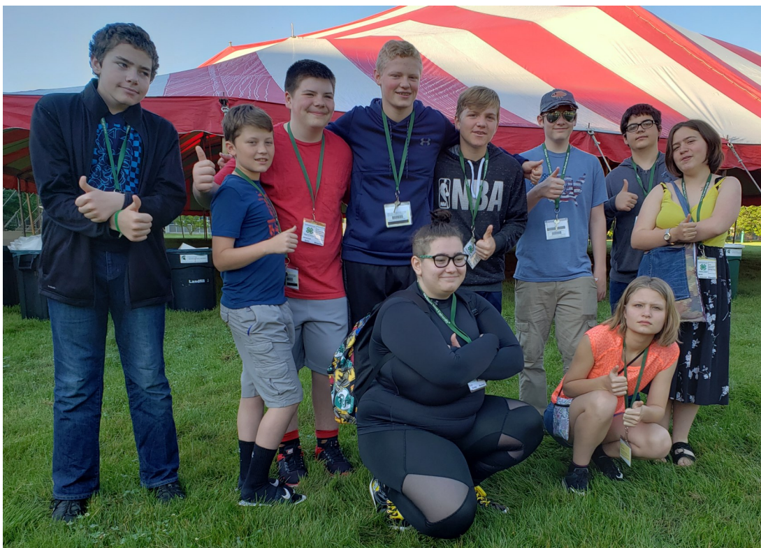
Bottom: Several local youth took just a minute break from all of the activities at Exploration Days 2019 for a picture.