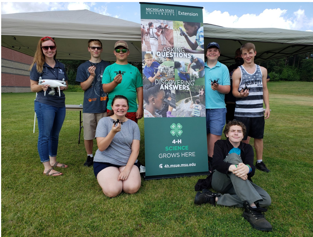
Top: 9 youth from Wexford and Missaukee Counties participated in the Wexford County 4-H Drone SPIN Club July 15-18.