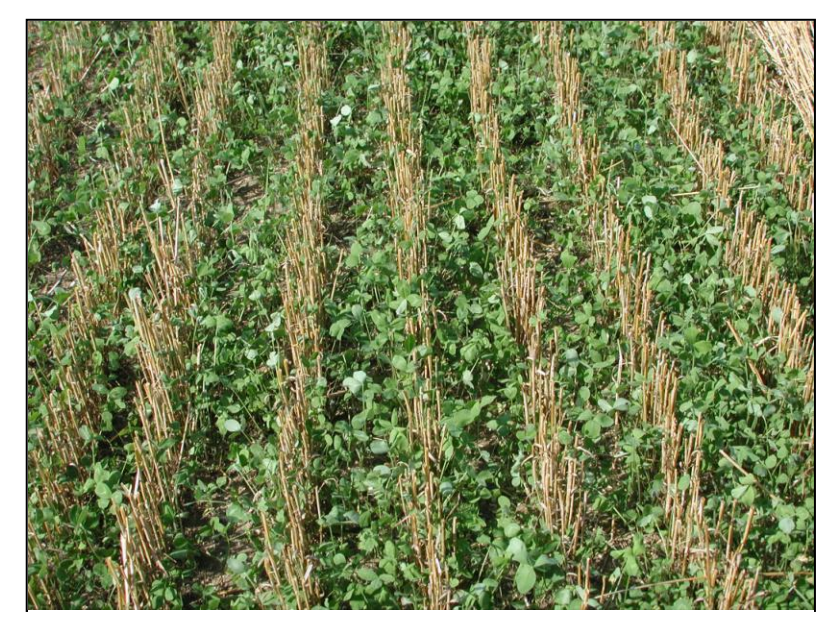
A red clover stand that was frost seeded into wheat.

Michigan's three common red clover cultivars are Michigan mammoth, Canadian mammoth (also known as Altaswede clover) and June (also known as medium red clover). Choose a cultivar based on how the seeding will be used. Canadian-grown mammoth clover does not tolerate the increased shading and competition from well fertilized wheat, but works well when seeded with oats. Michigan mammoth and June clover have been shown to perform better when frost seeded into well fertilized wheat fields.