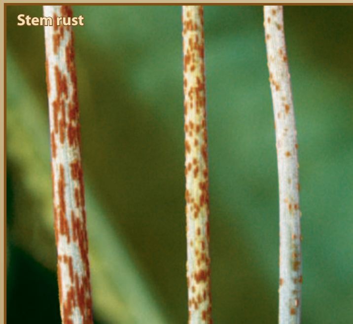
Figure 3. Examples of the variability in symptoms caused by stem rust (below), leaf rust (upper right) and stripe rust (lower right) as a result of unique interactions with wheat or barley varieties.

All three diseases have unique interactions with common varieties of wheat and barley. These interactions can modify the disease symptoms resulting in reduced lesion size and varying amounts of yellow or tan tissue surrounding the lesions (Figure 3). Becoming familiar with the range of possible symptoms for these diseases will improve the accuracy of the diagnosis and the management of these economically important diseases.