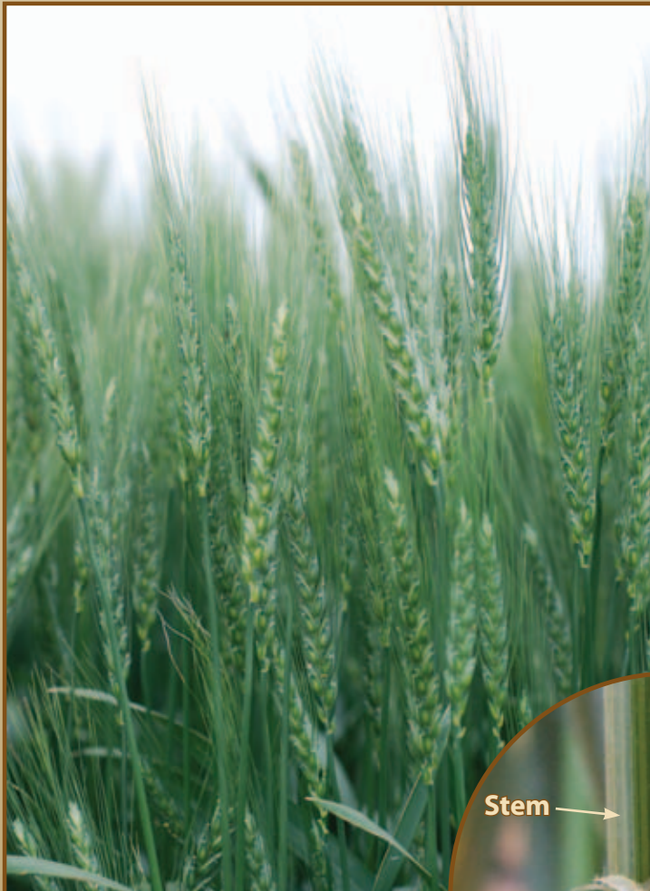
Figure 1. The diagnosis of rust diseases requires some basic understanding of plant anatomy and a quick review of this information may improve the accuracy of the identification process.

depends on host susceptibility and weather conditions, but the loss also is influenced by the timing and severity of disease outbreaks relative to crop growth stage. The greatest yield losses occur when one or more of these diseases occur before the heading stage of development. Early detection and proper identification are critical to in-season disease management and future variety selection.