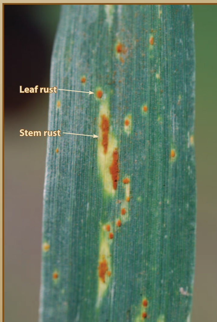
Figure 2. Comparison of the stem rust and leaf rust lesions on leaf tissue. Note the larger diamond shape of the stem rust relative to leaf rust.

Differentiating the rust diseases can be difficult, but with practice they can be reliably identified. Begin by considering broad characteristics such as which plant parts are affected (Figure 1) or arrangement of the blister-like lesions on plants. These characteristics will often separate one or more of these diseases quickly. Continue by examining less obvious characteristics including lesion size, shape, and color to either confirm the diagnosis or separate the more similar diseases. For example, stripe rust is the only one of these diseases to have the blister-like lesions organized into stripes on the leaves (left). If the lesions are scattered on the affected plant parts, both stem rust and leaf rust are a possibility and additional characteristics must be considered. Leaf rust typically causes small, round lesions on the leaf blades and leaf sheaths. In comparison, stem rust causes oval or elongated lesions and is capable of infecting nearly all aboveground parts of the plant, most notably the true stems (Figure 2).