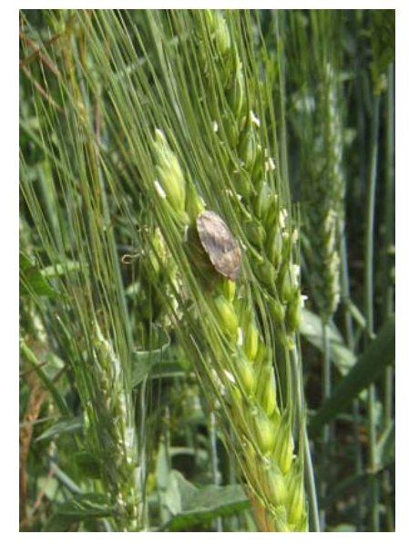
Sunn pest on wheat