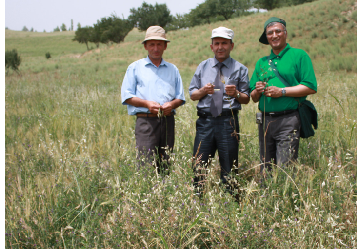
Cultivated Oats. Khatlon, Tajikistan

The demonstration sites also served as a focal point for teaching local farmers and NGO representatives about the benefits of planting forage crops and shrubs as both livestock forage and household fuel. The sites will help us to develop more comprehensive training programs, in both Tajik and Russian, to communicate with more local stakeholders about good livestock management and agricultural practices, including seeding pasture land with forage crops and seasonal pasture rotation.