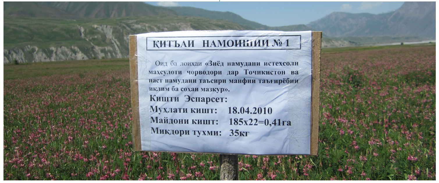
Alfala trial. Jirgatol, Tajikistan

Our education efforts will continue through local representatives and NGOs. There are several ongoing and new initiatives under USAID in the country. The Research Institute of Livestock (RIL) under TAAS has partnered on the project and is attempting to leverage resources from this LCC CRSP project to continue the farmer outreach and education programs. The demonstration sites will become part of the regular work of the RIL.