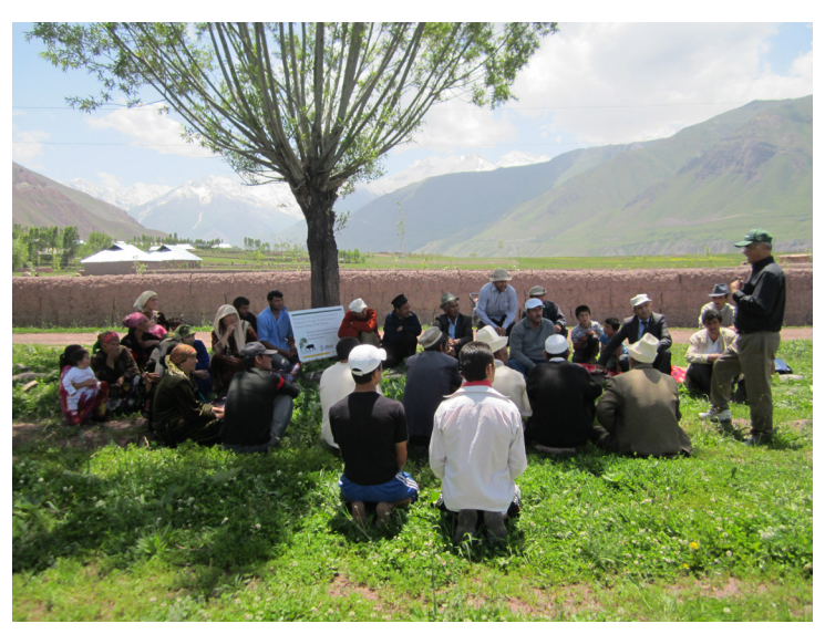
Farmers meeting, Muckoy Jamoat, June 15, 2011

"In order to address the growing need for availability and quality of livestock feed in Tajikistan, we began an exploratory project to identify production issues that will be essential for the improvement of livestock production."