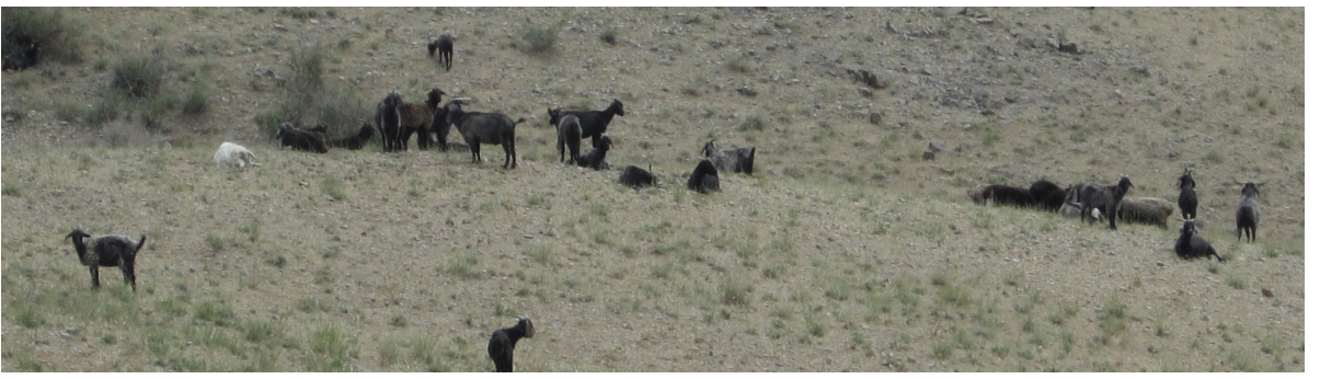
Sheeps and goats on the summer pasture.

In addition to warming temperatures and a growing livestock industry, Tajikistan has also experienced severe deforestation. The lack of plant fuel means more and more animal manure is used for heat and cooking fuel instead of fertilizer, which further degrades the quality of pastures and increases the need of supplemental feed for livestock.