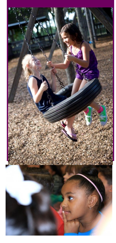
Children can be taught how to pay attention and pause before reacting to stress.

Encouraging healthy behaviors helps reduce health care costs by providing safe environments throughout a person's life span.