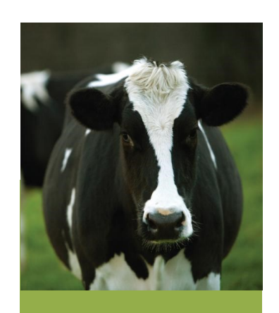
Allegan County ranks 5th in Michigan milk production according to the 2012 USDA Ag Census.