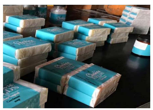
Bars of soap made at Cheshire Farms, one of the stops on the Arts and Eats tour.