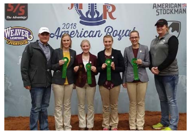
Livestock Judging Team at the American Royal Show in Kansas.