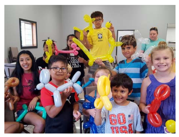
4-H Youth pose with their balloon animals at the Linking Center Kickoff event.