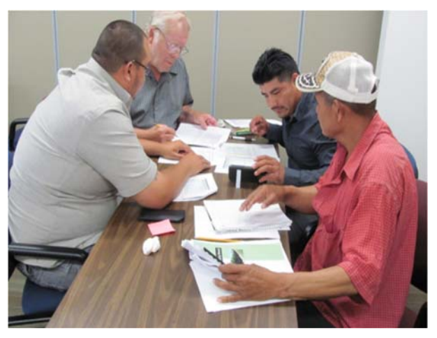
Hands-on training to develop a spray program using training notes and Enviroweather.

On June 15, 2018, blueberry growers received training to manage the spotted wing Drosophila (SWD) under a System Approach to Pest Management. The SWD is causing tremendous damage to the economy of small blueberry growers in Allegan County and all major Michigan small fruit producing counties. Training consisted of one-day classroom and hands-on session. This is an advanced Integrated Pest Management program that provides knowledge and skill to manage the spotted wing Drosophila at levels that allow the sustainability of blueberry production and employment in small blueberry farms.