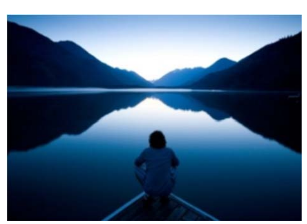
Research has shown that practicing mindfulness is effective in reducing stress-related symptoms such as worry, depression and physical tension.

Mental health in Allegan County continues to be an important and complex issue. Through two trained experts, MSU Extension brings it's evidenced based programming such as "Stress Less with Mindfulness," "Relax: Alternatives to Anger", "Farm Stress Management" and "Mindfulness with Children" in Allegan County that all focus on one's social and emotional well being. In 2018, a total of 115 Allegan County Residents received education on a myriad of these topics related to mental health.