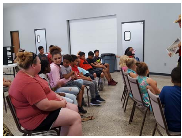
Youth gather for Beekeeping program at the Linking Center.

The kickoff event held at the Linking Center, located in Pullman, was the beginning of the 4-H Summer program that featured the 4-H International Program and an Educational Beekeeping Special Interest (SPIN) club. Children from kindergarten to 10<sup>th</sup> grade were involved, with a diverse representation. Other programs included wildflowers, pressing flowers, healthy games, dogs, duct tape crafts, clowning, exploring nature and Lego robotics.