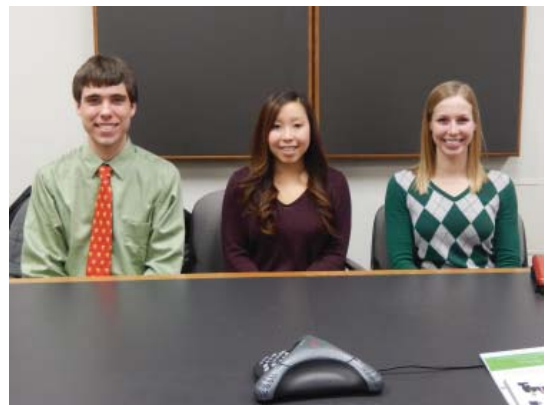
Team Members (L to R)

Client deliverables include a design with optimized operation parameters, testing that demonstrates the design solution’s effectiveness, a vendor recommendation, and an economic analysis of operation and capital costs associated with the design.