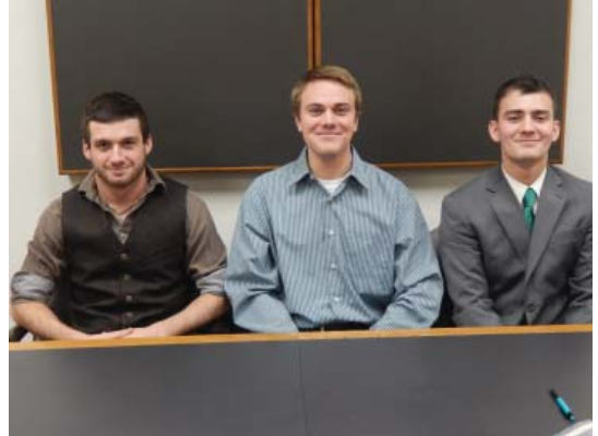
Team Members (L to R)

The purpose of this project is to identify and address problems encountered in the center pivot irrigation wastewater treatment process of a food production company. This project uniquely combines aspects of the mechanical, chemical, and biological areas as it looks at refining a process as a whole, rather than just a specific point in the process. It is through providing solutions to the identified problems that the team will deliver supported recommendations to better optimize the current process and improve adherence to standards set forth by the appropriate government agencies.