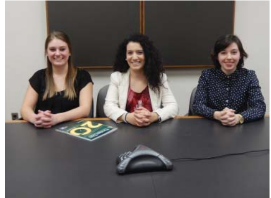
Team Members (L to R)

A design is proposed for a safe and wearable phototherapy treatment device that prevents the separation of mother and infant. The device is intended to be a portable and affordable treatment method for developing countries where jaundice is prevalent and power sources are limited.