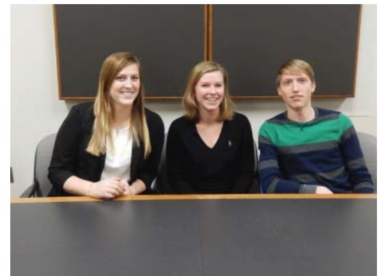
Team Members (L to R)

Team “Shuabb Systems” has designed an integrated system to provide potable water, wastewater treatment, and energy production for an ecotourism project led by the Shuabb Aborigine Women Association in Costa Rica. By integrating green technologies such as water filters, anaerobic digestion and constructed treatment wetlands, the project aims to secure clean water for human consumption and treat solid waste and wastewater, while creating renewable energy on site. The project is in cooperation with the Gender Equity Office from the Technological Institute of Costa Rica, and can demonstrate the economic value of such development in a region with limited access to public services.