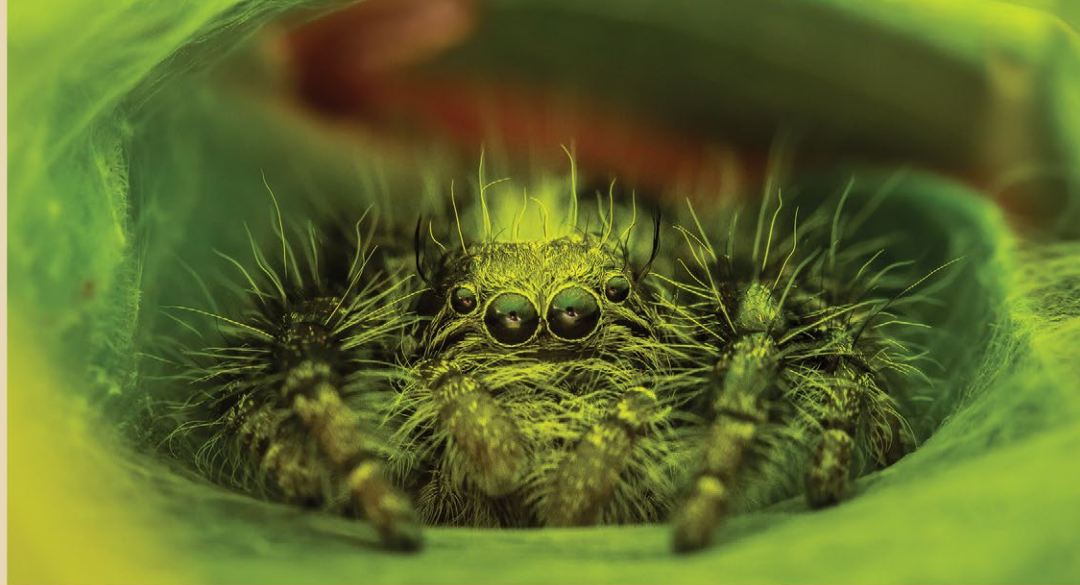
Jumping spider