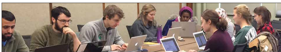
GUESS rallies MSU Entomology students to write annual progress reports.

Back to our graduate student working on mosquitos and