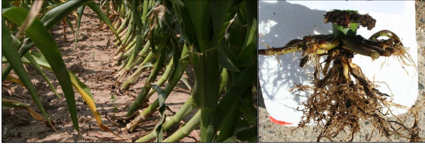
Unexpected lodging and root damage that cannot be explained by an agronomic or environmental problem, or presence of another root-feeding pest.

A key step is to confirm that plants are indeed expressing Bt toxin. This is done by grinding and testing leaf tissue to detect the specific type of Bt. The test is positive if two lines appear on the strip. Seed companies and the MSU Field Entomology Lab usually have access to strips for testing.