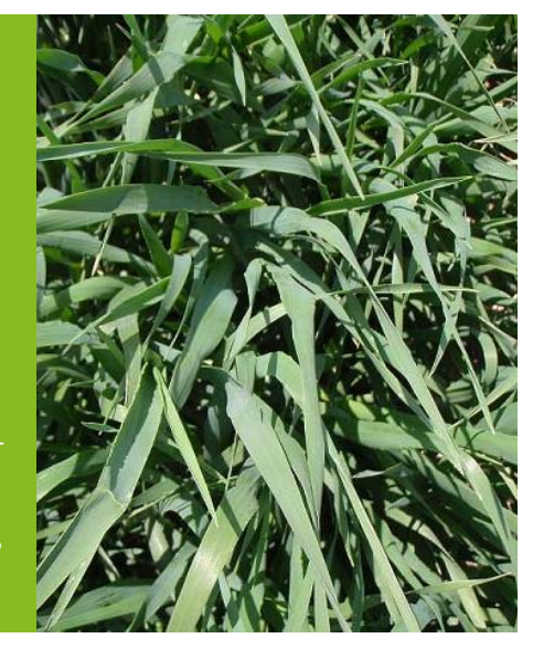
No larva (above)