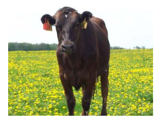
This is a photograph of one of the cross breed heifers that were on trial.