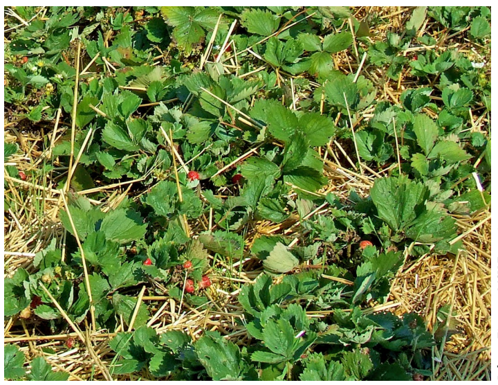
Using straw as organic mulch will help manage weeds.

Published January 2015. Updated January 2020. This publication is supported in part by the Crop Protection and Pest Management Program 2017-70006-27175 from the USDA National Institute of Food and Agriculture. Any opinions, findings, conclusions, or recommendations expressed are those of the author(s) and do not necessarily reflect the view of the U.S. Department of Agriculture.