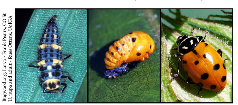
Different life stages of a beneficial lady beetle: larva, pupa, adult.

Understand that different life stages of pests do not look alike and that not all stages cause damage or