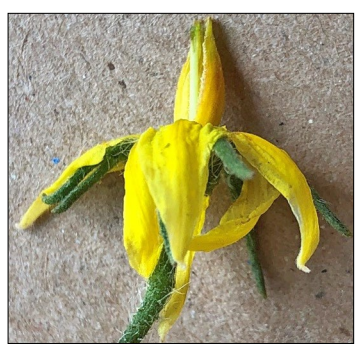
Figures 3a-b. Tomato flowers. Left, anthers forming a tube around pistil. Right, portion of anthers cut away to reveal pistil.

structures. Flower anatomy differs from the idealized image in Figure 1. Tomato anthers form a tube that completely surrounds the pistil (Fig. 3a). Figure 3b shows the anthers partially removed to reveal the pistil. Tomatoes, peppers and eggplants can be pollinated simply by wind shaking the pollen from the anthers onto the stigma. However, bumble bees can improve fruit set and size because they vibrate the flowers and shake pollen loose from the anthers.