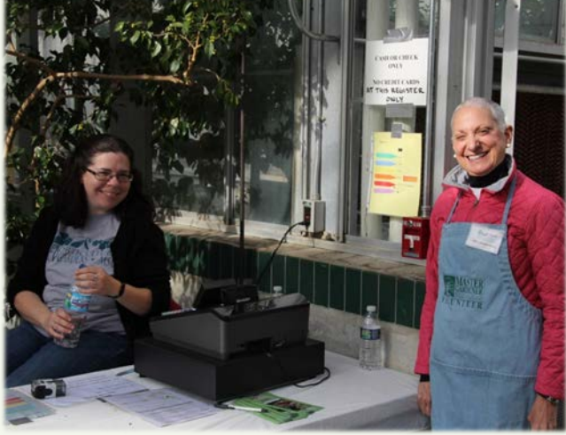
Our staff and dedicated volunteers work hard to make your shopping experience a happy one!