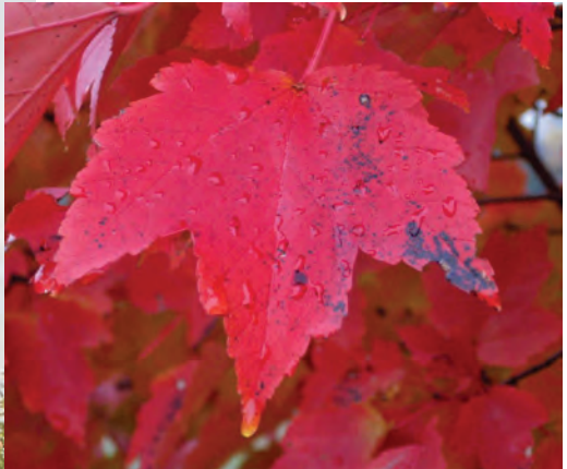
Red maple is an old standby for fall color.