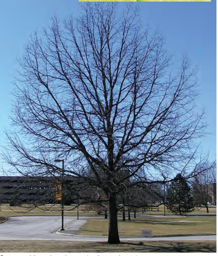
Swamp white oak makes a sturdy specimen tree. Photo courtesy: IPFW Grounds Dept. Inset: Finely lobed leaves of swamp white oak. Photo courtesy: IPFW Grounds Dept.