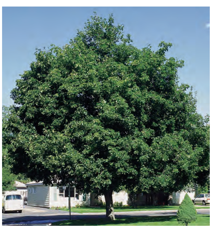
London plane tree is the quintessential shade tree