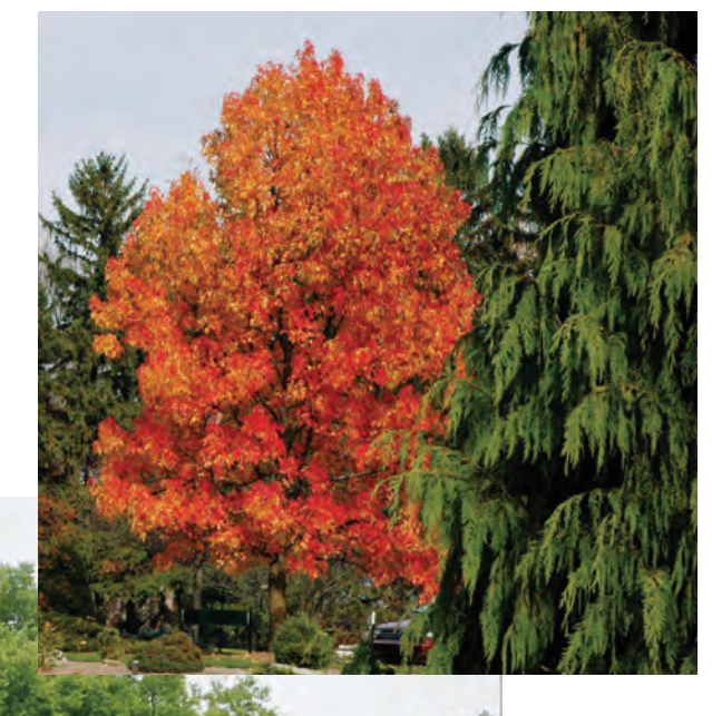
Hackberry frequently appears on "Tough trees" lists. Inset: Hackberry leaf close up.

Sweetgum can offer varied fall color from orange-red to purple.