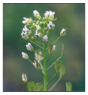
Field pennycress flowering cluster.