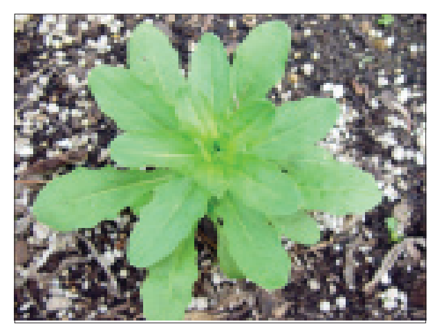
Field pennycress rosette.

Erect, mostly 2-foot-tall stems with varied branching bolt from a basal rosette to flower.