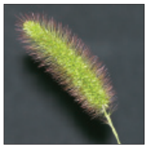
Green foxtail seedhead.

The seedhead is a dense, cylinder-shaped, foxtail-like panicle with green to purple bristles. Usually erect to slightly nodding seedheads are capable of producing prolific amounts of oval to egg-shaped, yellowish brown seeds. Reproduction