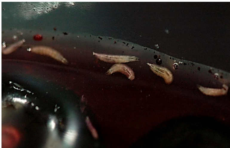
SWD larvae emerged from fruit and floating in a strong salt solution

If fruit are suspected of being infested by SWD, larvae can be sampled using a fruit dunk flotation method. Either collect a standard sample of fruit, or only suspicious (oviposition scars and soft spots) fruits. If you are sampling in fields, place fruit in a plastic “ziplock” bag and crush lightly to break the skin. Add a salt solution (1 cup salt per gallon of water). Leave the fruit in the mixture for 15 minutes, then check it. Drosophila larvae will float in the liquid making them easier to see, plus they should be visible as small white larvae against the blue colored liquid. Detection of small larvae may require the use of a hand lens, and this works well with a light behind the bag to shine through onto the larvae. If this is being done indoors, place suspect berries on a tray and pour the salt solution over the lightly crushed fruit. Observe the fruit after an hour to see if larvae are present. Note that this method doesn't allow for differentiating between SWD larvae and other similar species. The only way to be sure larvae in the fruit are SWD is to rear them until they are adult flies.