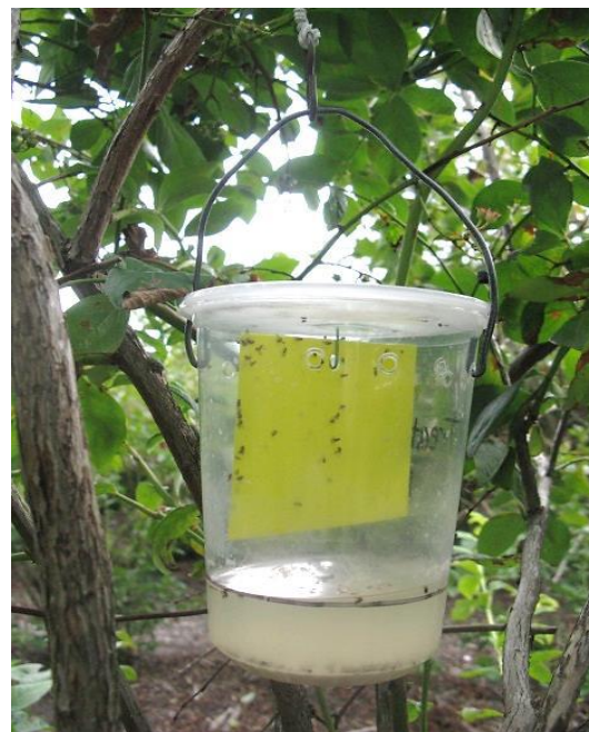
Homemade trap for capturing adult SWD flies.

These flies can be trapped using a simple homemade monitoring trap consisting of a plastic 32oz cup with ten 3/16"-3/8" holes around the upper side of the cup, leaving a 3-4 inch section without holes to facilitate pouring out of the liquid attractant, or bait (Figure). The holes can be drilled in sturdy containers or melted with a hot wire or soldering iron. The small holes allow access to vinegar flies, but keep out larger flies, moths, etc. The traps are baited with a yeast-sugar mix, made by combining 1 Tablespoon of active dry yeast (we use Red Star brand) with 4 tablespoons of sugar and 12 oz of water. This ratio produces a solution that ferments and the flies are attracted to the odors. Comparing this mix to apple cider vinegar, we found that SWD were trapped earlier, more of the traps caught SWD, and SWD was trapped in greater numbers than with the apple cider vinegar. Although these traps are harder and messier to service, the yeast bait is less expensive than the apple cider vinegar traps, and the benefits of earlier detection are obvious when needing to protect crops from infestation. Traps baited with yeast will collect many flies, so sorting through these traps will take more time.