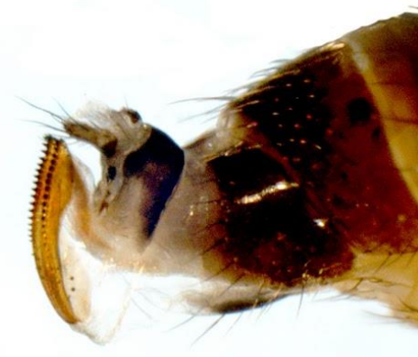
The ovipositor of female SWD is serrated, allowing them to cut into intact berries.

If this pest is not controlled, fruit may be harvested with the white larvae inside, potentially leading to rejection and lost sales. So, it is very important that Michigan blueberry growers incorporate control of SWD into their blueberry IPM programs to ensure that the impact of this new pest is minimized. Effective management of SWD consists of these key components: