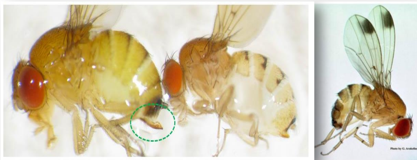
L-R: a female SWD with the ovipositor highlighted; a 'look-alike' Drosophila fly; and a male SWD.

Male SWD have a distinctive spot on each wing (right panel photo). In contrast, female SWD (left panel) do not have dots on the wing, so their ovipositor needs to be examined closely in search of its serrated characteristics. Use a 30X magnification hand lens or microscope to detect the distinctive saw-toothed ovipositor on female SWD. This is challenging to detect, so we recommend that people familiarize themselves with the distinctive features for identifying