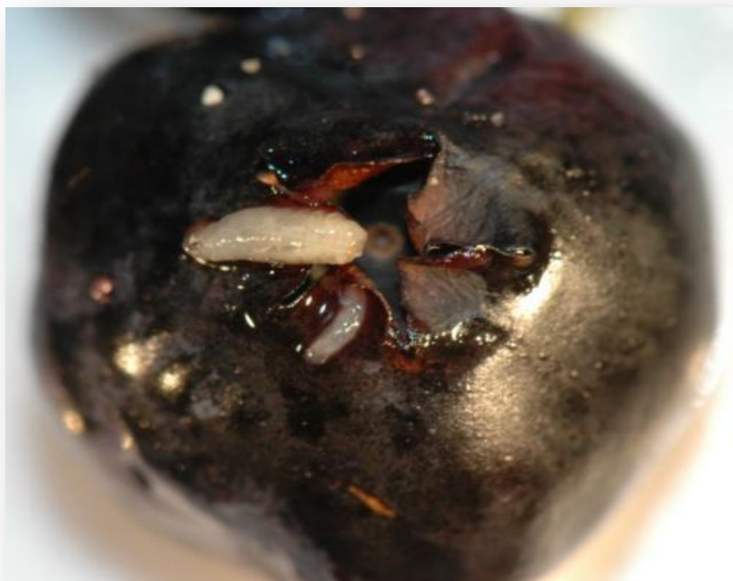
Relative size of blueberry maggot larva (top) and SWD larva (bottom).

Berries can also be sampled using the standard boil test used by processors for blueberry maggot detection. To do this, cover a sample of berries with water and boil for one minute then pour the fruit and liquid onto a mesh-covered frame over a tray and mash the fruit with the back of a spoon. Lightly wash through with water and look in the tray for larvae. This method works very well for detecting SWD larvae, which are smaller than blueberry maggot (see photo). It should be noted that young blueberry maggot larvae are difficult to distinguish from SWD larvae, but specimens can be separated based on their shape, and the structure of the larva from features visible under a microscope. Although the boil test is used as a standard sampling method for checking fruit by processors, it would be better to detect any potential infestation in the field and control it before any infestation reaches the processor.