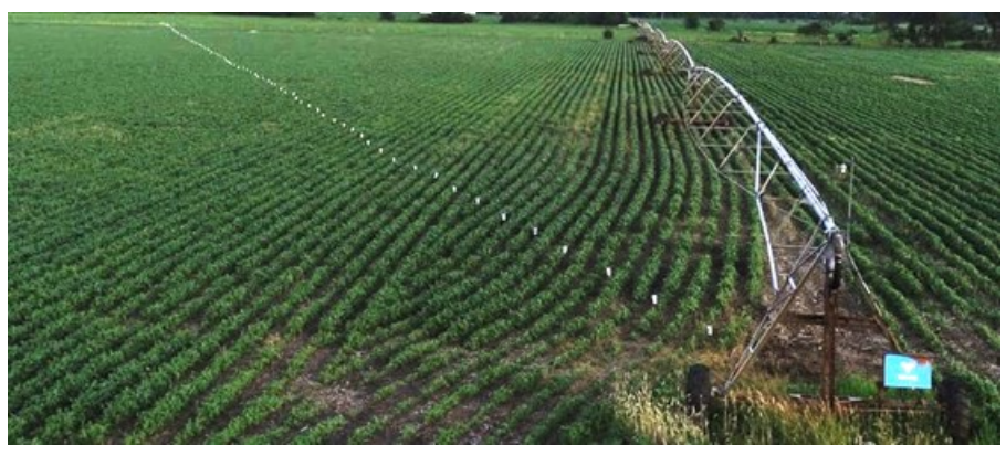
Figure 1: Catch Can Test Demonstration

system, an evaluation must be conducted. The catch can method is simple and effective in evaluating the uniformity of the irrigation system. The procedure includes placing 32 oz disposable soda cups at 10 ft distance apart in a straight line outward from the pivot elbow. Once the catch cans are installed in the field, start the irrigation, then measure the water level in each of the cans using a graduated cylinder and recorded. Figure 1 shows a demonstration of the catch can test in Three Rivers, MI.