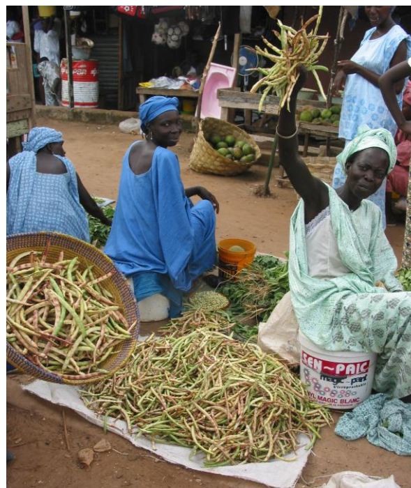
Senegalese women selling cowpea pods in a market

Given the importance of harvesting improved varieties as green pods, the grain yields reported in table 1 underestimate the true value of production per ha of these varieties compared to traditional varieties. Although the harvest of green pods is significantly lower than that of dry grain, it is still significant. For