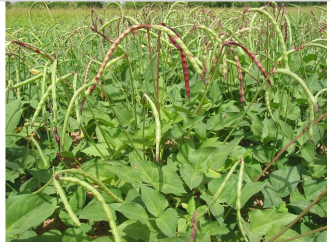
Cowpeas growing in a farmer's field in Senegal

This brief summarizes the results of an adoption survey conducted in 2010 to assess the impact of cowpea research and seed system development efforts in three main cowpea growing regions in Senegal: Diourbel, Thiès, and Louga. Results from this survey and past impact studies are used to derive the estimates of cowpea varietal adoption over time and the gains in yield from the adoption of improved varieties. An economic surplus modeling approach is used to estimate aggregate benefits from the adoption of improved varieties. These benefits are then compared to the costs of research on cowpea improvement and variety dissemination to derive rate-of-return estimates on these investments.