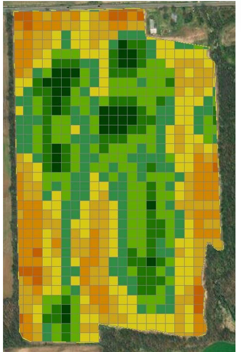
Figure 1 Normalized Difference Red Edge (NDRE) values at sidedress. Green areas indicate above-average biomass.

The sensors are positioned on the applicator above the crop canopy and measure chlorophyll content and thereby N needs by light reflected by the crop canopy. The best results come with sidedress applications made at or after growth stage V6. The sensors have a built-in light source, so they work as well