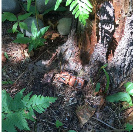
Toy truck at the base of the tree.