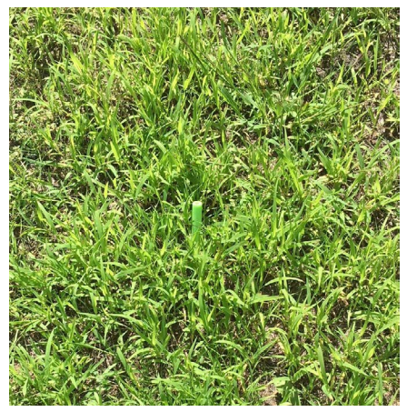
Foam dart in the grass.