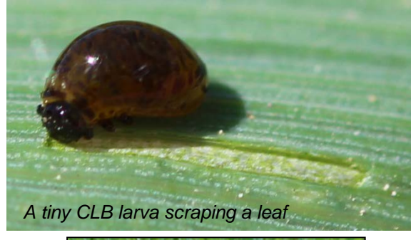
Typical CLB feeding in Michigan winter wheat is light (above), involving isolated plants and a few larvae.

Hot spots can have impressive numbers of CLB. The damaged (white) swath in this spring wheat field had larval counts of ~2 per plant, compared to almost no larvae in the green uninfested area by the road. In the previous season, the two fields just to the south of this area were planted to winter wheat (larval host) and corn (adult feeding). Note the tree lines across the road and in the distance, likely overwintering spots for beetles.