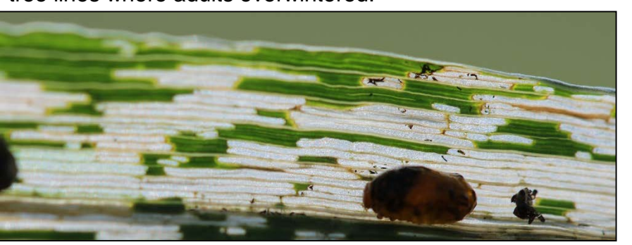
Severe feeding by multiple larvae can remove nearly all green tissue from the leaf surface (above). This results in leaves appearing white. Entire parts of fields may show a frosted appearance (below)

Larvae feed for 2-3 weeks, with peak populations occurring in late-May into early June. Larvae feed by scraping the leaf surface; when defoliation is severe, plants or parts of fields appear white or frosted. Larvae do not feed on the grain head directly, but damage to the flag leaf after boot stage reduces grain fill. While severe defoliation across an entire field is rare in Michigan, hot-spots can be impressive. Infestations tend to be greater along field edges and near tree lines where adults overwintered.