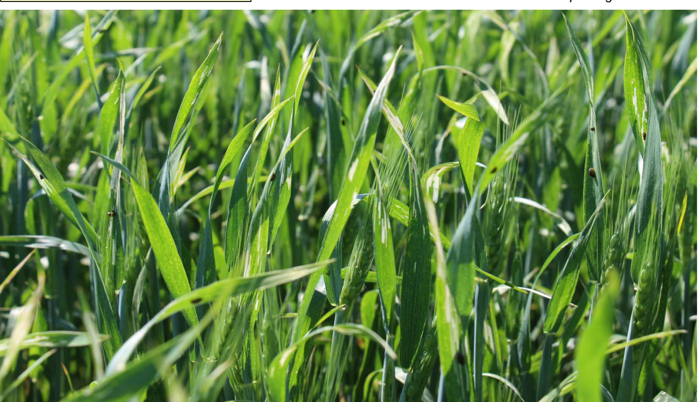
2 larvae per flag leaf