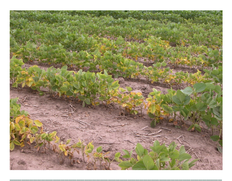
Figure 3 . Usually, above-ground symptoms of SCN appear in the field as patches of very stunted and chlorotic (yellow) plants.

As previously mentioned, common aboveground symptoms of SCN are stunted plants and the yellowing of foliage (see Figure 3). These symptoms usually appear in circular or oblong patterns within the field. SCN symptoms can be similar to those of nutrient deficiencies or soil compaction.