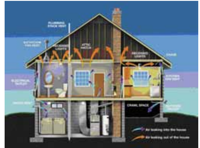
Total Green Energy Solutions