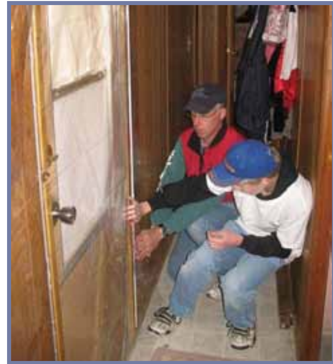
Community Energy Project