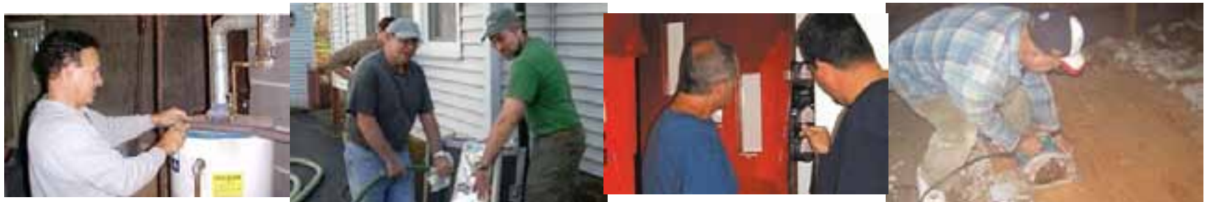
Springfield Partners Inc.