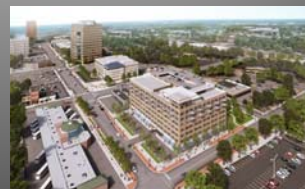
The Grand (Proposed)