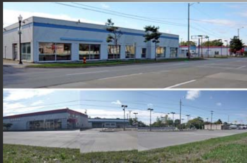
BEFORE Abandoned Car Dealership