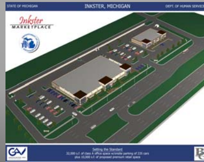
Proposed 32,000 S.F. Class A Office Building; 10,000 S.F. Shopping Center