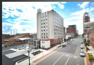
Davenport University's Lansing Campus