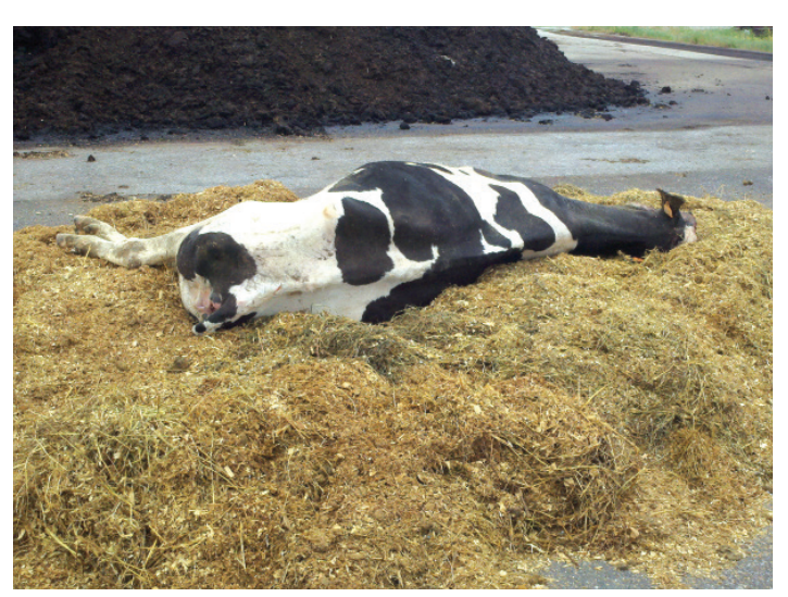
Photo 2. Cow carcass placed in the center of the compost pile foundation.

The carcass should be placed in the center of the pile (Photo 2) to ensure that all parts of the carcass are enclosed by the bulking agent(s). A guideline on pile size is to have 24 inches of bulking agent surrounding the entire carcass or animal mass (Photo 3). When estimating the amount of bulking agent needed under and over a carcass, plan for 1 cubic yard of bulking agent for every 100 pounds of carcass weight. For composting young stock mortalities, multiple animals can be positioned in a single batch (pile), but the batch or pile of carcasses should still be surrounded with 12 to 24 inches of bulking agent.