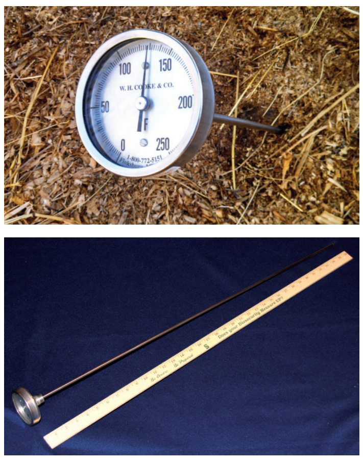
Photos 7a and 7b. Long-stem thermometer (available commercially as "compost" or "windrow" or "hay" thermometer) is used to monitor internal temperature.

An actively composting static pile will increase in temperature over the first several days and then generally level off or continue to rise slightly. The internal temperature of the compost pile must be monitored and recorded once weekly. This can be accomplished by inserting a long-stem thermometer at least 12 inches into the compost pile (Photos 7a and 7b). The temperature within the pile should reach a minimum of 130 degrees F. During active composting, the temperature may remain in a range of 100 to 150 degrees F for several weeks before decreasing. The pile should be turned when compost temperatures have been at 100 degrees F or more for one to two weeks. It is important for the compost pile to reach these high temperatures to ensure the destruction or deactivation of pathogenic organisms. If your static pile does not reach these temperature levels within a few days, the pile may need adjustments to aeration, C:N ratio or the water content of the pile contents.