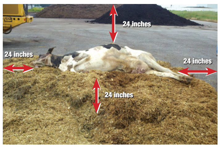
Photo 3. Illustrations showing the most desirable depth of bulking agent that should surround the carcass.