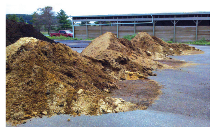
Photo 6. Michigan law requires that each batch of mortality compost be turned at least two times after pile formation to add air back into the material and to achieve additional periods of temperatures greater than 130 degrees F (three such high temperature cycles are required).