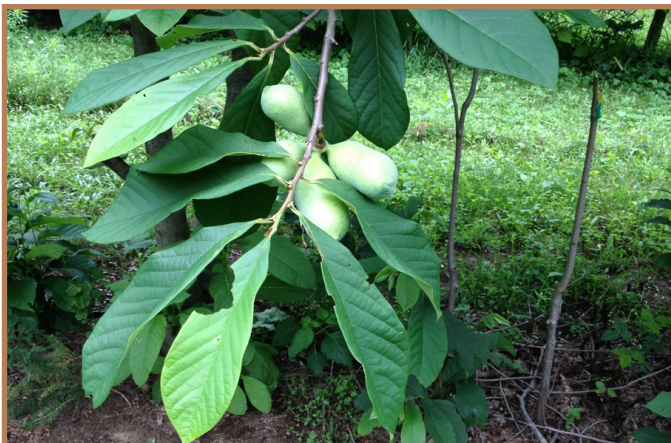
The MSU pawpaw research program was developed to identify successful practices for growing this specialty crop in Michigan. Conference attendees will learn more about the university's research program during educational sessions and field trips.

"The information that chestnut growers and growers of other specialty commodities learn during this session will be valuable because it can be applied to any farm market or grocery store situation." - Dennis Fulbright