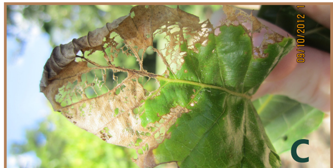
Image A is a double-sided yellow sticky trap for catching potato leafhopper. Image B shows the stunted, necrotic and cupped appearance of a chestnut leaf cause by potato leafhopper feeding. Image C shows feeding damage from Japanese beetle.

online articles addressing pest management in chestnut and weekly scouting reports during the growing season. What if you can't remember how to access the page? That's okay! You can sign up to receive weekly emails of chestnut-related articles via MSUE News. You can also opt to receive updates on other topics or cropping systems of interest to you. To access these resources, visit msue.msu.edu and select the "Agriculture" tab at the top of the page.