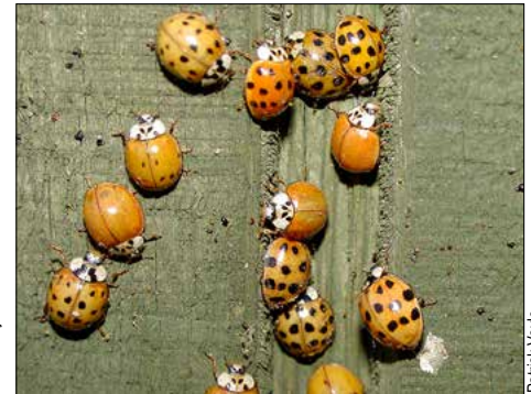
Multi-colored Asian lady beetles.