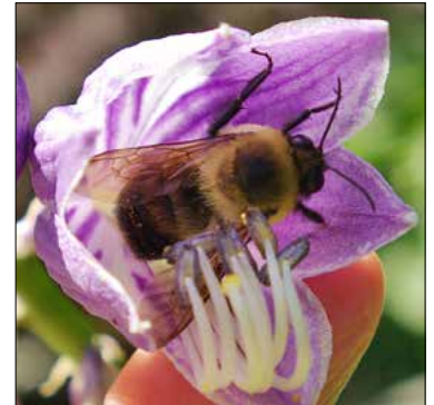
Hosta blooms, usually dead-headed for aesthetics, can be left a little longer so pollinators can access them.

Beyond planting the right plants, gardeners should be thinking more about judicious use of insecticides – that is, either not using them or finding “green” products, always following label directions and always making sure never to spray on open blooms. While dead-heading plants like sneezeweed encourages additional blooms, early dead-heading of Hosta blooms may rob the pollinators of a great lunch. Blooming coleus may be thought of as unsightly, but not to a bee. A member of the mint family, these small blooms are very attractive to bees. Perhaps it is more about the way we think of “tidiness” in the garden and we let some things go.