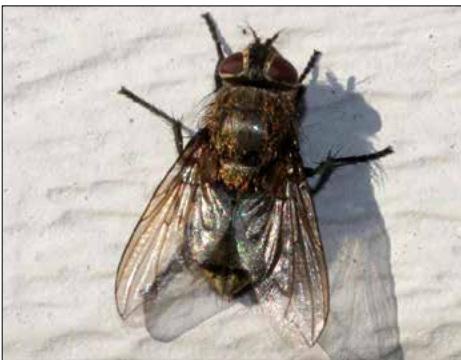
Whitney Cranshaw, Col. St. Univ., Bugwood.org

The key to not having unwanted guests is to do some late summer home inspection right about now. You are looking for cracks and crevices that an insect could slip through. That crack does not have to be any wider than the thickness of a credit card. If time is limited, start with the two sides of the house that are the warmest: the south and west sides where many insects hang out. Caulk cracks around windows and doors. Check around anything that is cut into the exterior of the house like a dryer vent, gas line or light fixtures that do not have a bead of caulk surrounding them. Check or repair door sweeps. Vinyl and aluminum siding offer many places for insects to slip under and this is not easy to fix. Pesticides are often not very effective, so try the home tweaking first.