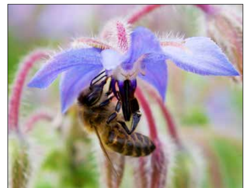
Consider adding herbs to your flower borders including borage, a bee magnet.

Punchkinia and Chinodoxa attract the tiniest of bee species. Perennial favorites such as bleeding heart, foxglove and Allium ‘Purple Sensation’ bring in the late-spring show audience and larger bees are often seen feeding on these beauties. Herbs like chives also will be very attractive to pollinators.