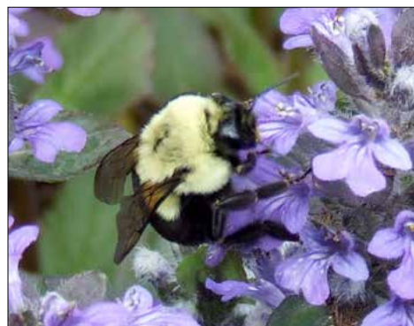
The blue-purple bugleweed bloom is shaped just right for this hungry bumble bee.

The earliest spring-blooming plants such as Pachysandra , rock cress and bugleweed buzz to life with insect activity when windy spring weather makes it difficult to navigate the canopy higher up. Also low to the ground, minor bulbs like Siberian squill,