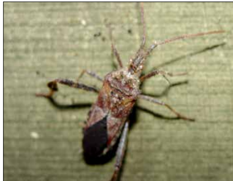
Western conifer seed bug.