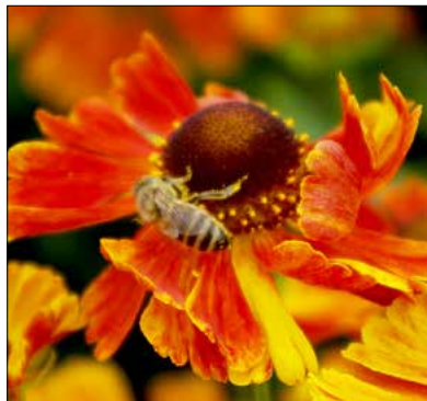
Plants like Helianthus (sneezeweed) when dead-headed will re-bloom and continue providing nectar and pollen right through the late season.

Sedum has to be one of the most diverse plant groups in the garden or landscape. From low-growing, colorful ground covers to the upright, stately 'Autumn Joy' sedum, their blossoms are intoxicating for many bees and flies. These late-season bloomers