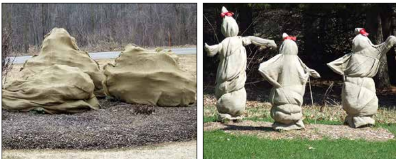
Simple burlap screens may shade the plant during winter. This can be done as a wrap or simply attaching burlap to surrounding stakes to keep the plant protected. Some even get creative with winter protection.

The windscreen can remain in place until early to mid-March. Posts can remain until the ground thaws. This windscreen also helps prevent animal damage, especially if the wire is hardware screening. When this wire is pushed into the ground, it deters entry by voles and rabbits. If deer are a problem, crisscross wire or heavy string over the top of the cylinder so deer can't lean in and chew the tops of plants.