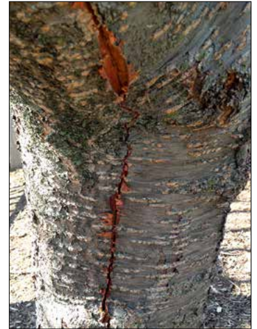
Trees with thin bark such as cherry may "frost crack" during a severely cold winter. Bark wraps will help shade the trunk from the sun.

Sunscald and frost crack can occur on cold, sunny, winter days. Bark heats up to the point that cambial activity resumes, then the temperature of the bark drops rapidly when the sun is blocked by a cloud, or when it drops behind a barrier such as a hill. The quick drop in temperature kills the active tissue. To prevent sunscald, wrap the trunk with a commercial tree wrap, plastic tree guards, or use white latex paint to reflect the sun and keep the bark at a more constant temperature. If using tree wrap, put it on in the fall and remove it in the spring after the last frost.