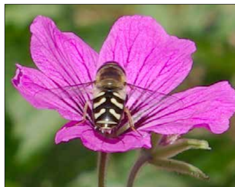
Hover flies work many of the same plants as bees, like this perennial geranium.