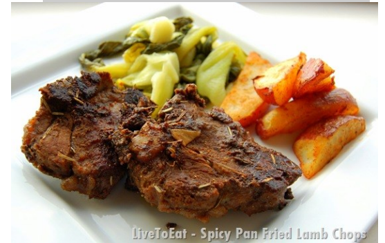
LiveToEat - Spicy Pan Fried Lamb Chops

Sheep can cost $100 or more!!! But just think about all the yummy food you will have. And you will be helping out athe 4_h program and making "the best better!" Thank you!!!