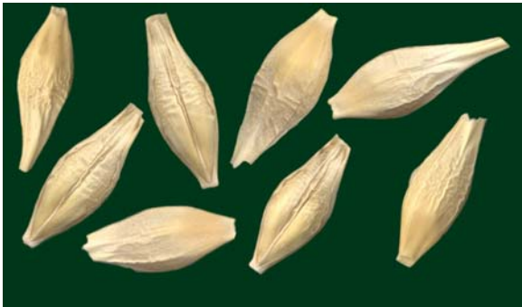
Above – Properly threshed malting barley. Below – Germinated barley from properly threshed malting barley. Note that the sprout is completely protected by the undamaged husk.

In making malt, barley is steeped in water until it reaches high moisture content. The barley is then germinated under controlled conditions. This sprouting results in activation of enzymes which break down starch granules in the grain so that they may be converted to dextrins and sugars that are important in processes that use malt.