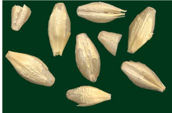
Above – Skinned and broken kernels from improper threshing.

A high percentage of skinned kernels results in inferior quality malt. The undamaged husk on sound kernels provides a protective covering for the developing sprout or acrospire which grows under the husk towards the awn end of the kernel. Skinned kernels take up water faster than sound kernels, and therefore grow faster. Germination must be uniform and complete so all the kernels are completely malted. Skinned kernels or kernels with damaged husks germinate with exposed sprouts which are easily broken off when the barley is