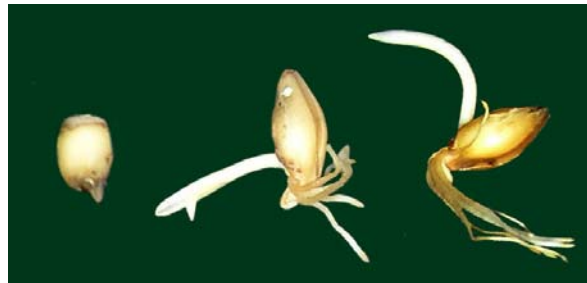
Below – Skinned and broken kernels of germinated barley. Note exposed sprouts.

stirred during malting. If the unprotected sprout is broken off, germination is interrupted and the kernel is not completely malted. Skinned kernels are also more susceptible to mold growth than kernels which are protected by the husk.