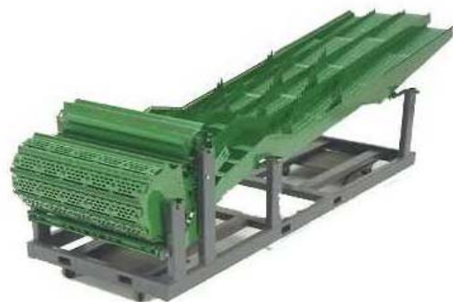
Walker Type Combine

The combine platform and feeder adjustments are similar for most types of platforms and feeding systems. All types of headers must be properly leveled to ensure the crop feeds evenly into the feed house and onto the combine cylinder. There should be 3 mm (1/8") clearance between the feeder conveyor chain and the feeder housing floor. The belt speed of pickups used with windrowed grain should be slightly faster than the combine's ground speed.