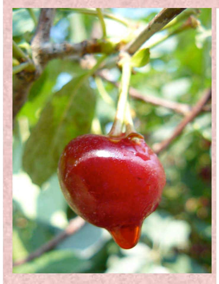
Harvested 7/16/08 and soft fruit test on 7/17/08 performed by N. Rothwell and E. Lizotte