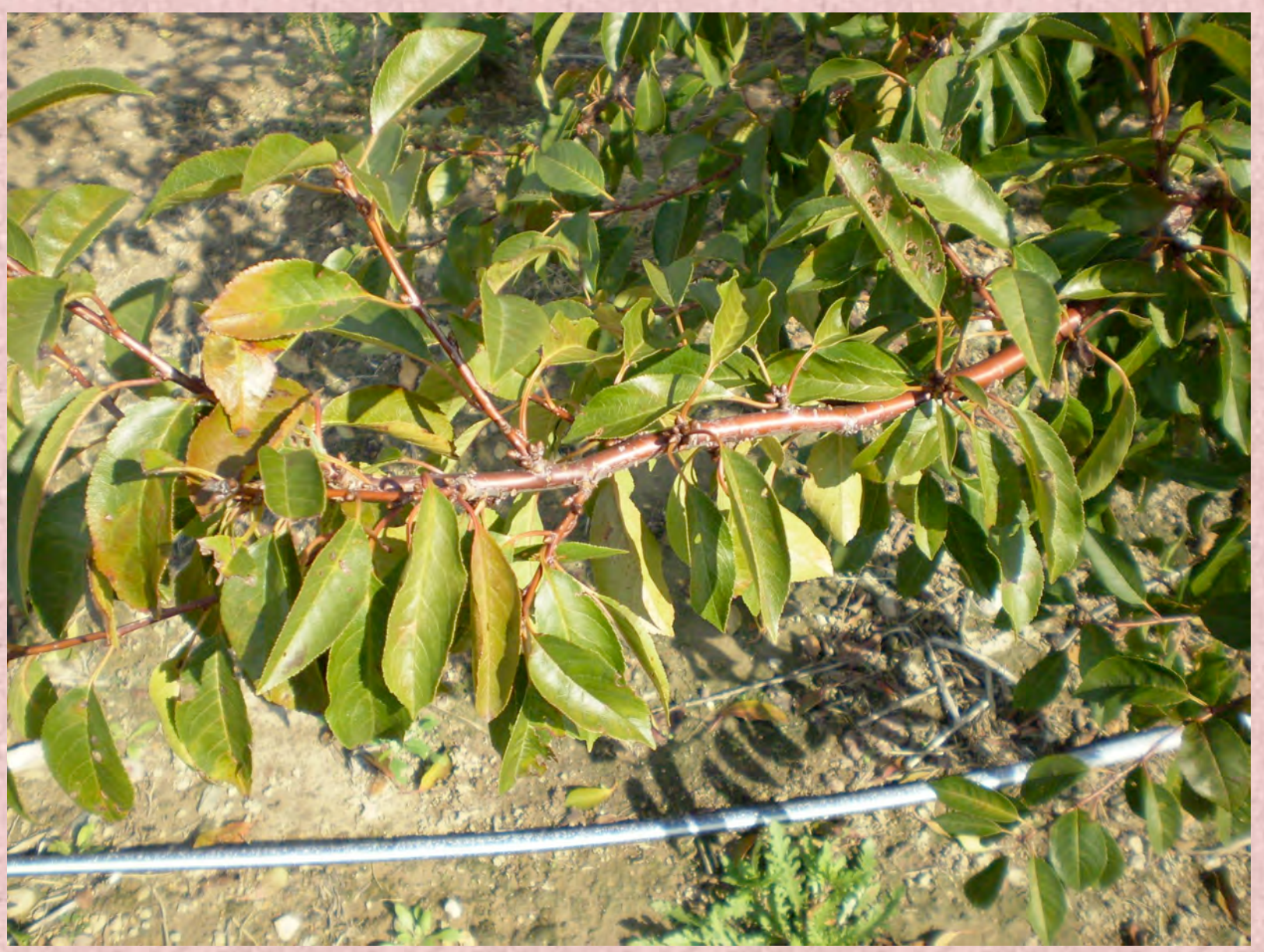
No damage to canopy and foliage