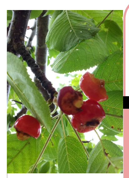
Cherries damaged by birds.