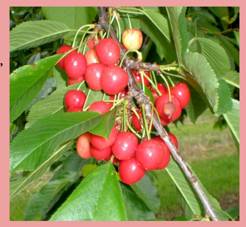
Cherries are a high-value crop in the US.

Bird damage is a persistent problem faced by fruit growers. The economic impact of bird damage and the value of bird management are poorly understood, particularly for fruit crops. In 2012, funding was provided by USDA's Specialty Crop Research Initiative to perform an interdisciplinary research study of bird damage to 'Honeycrisp' apples, wine grapes, blueberries, and tart and sweet cherries in five states: California, Michigan, New York, Oregon, and Washington.