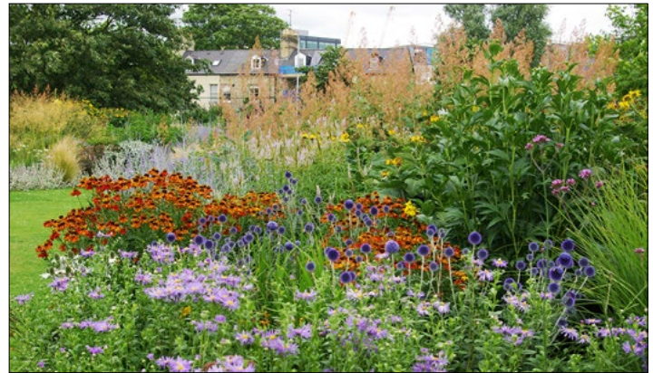
Turning your lawn into a low-maintenance prairie filled with native plants will attract pollinators.