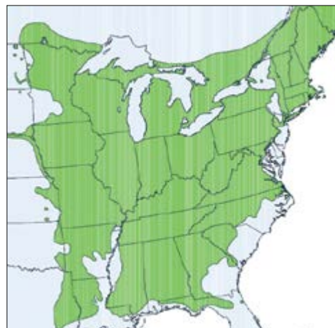
U.S. Geological Survey