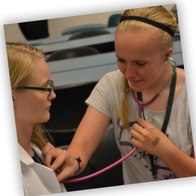
Figure 1. Sample of a Group Budget.