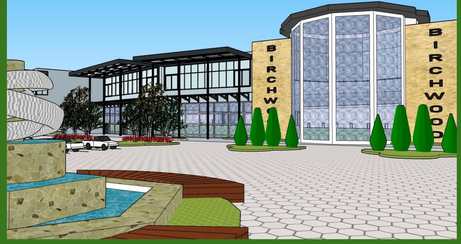
Conceptual rendering of Birchwood Mall featuring the addition of a second story.