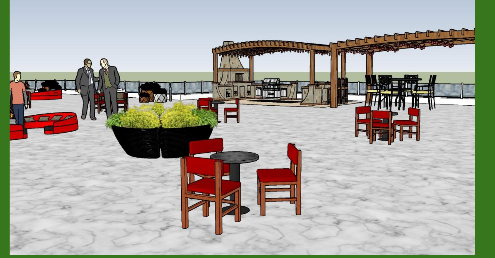
Conceptual rendering of second story rooftop dining space overlooking Lake Huron.

Objective 2.1: Addition of mix of affordable, unique, and high-end restaurants and drinking places Objective 2.2: Addition of office space Objective 2.3: Develop green and open spaces at various locations on Birchwood Mall property Objective 2.4: Addition of recreation